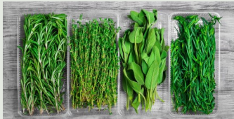
Parsley, Sage, Rosemary and Thyme?

Could we ever forget the old Simon and Garfunkle song Scarborough Fair ?