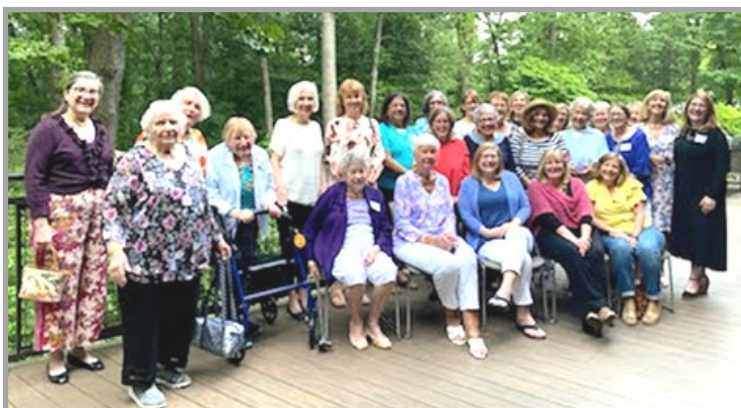
June Gathering at Jenkins