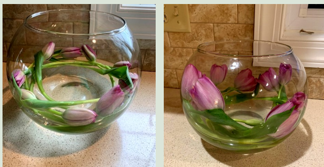
The picture on the left is the first day in the water and the picture on the right is 3 days in the water. Notice how the tulips are opening, and they will continue to open!