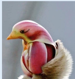
The bud of a Yulan Magnolia native to China

Mother Nature plays a trick on us by making flowers that look exactly like birds.