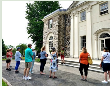
The Woodlands Mansion