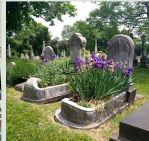
Cradle Grave Gardens