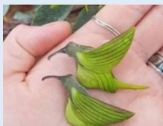
Green Birdflower looks like a Hummingbird