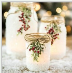
Mason Jar with Candle