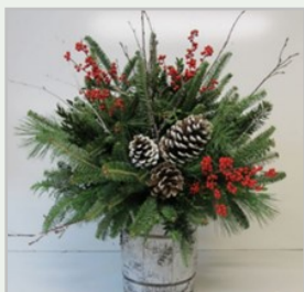
Fresh Greens Arrangement