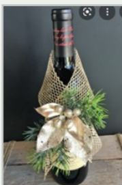
Wine Bottle Wrap