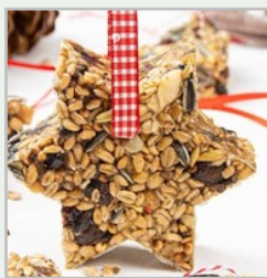
Bird Seed Ornaments